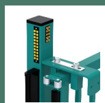
Surface mounted lighting (motorised operation)