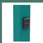
Two LV detection cells (motorised operation)