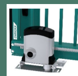
Motorisation for moderate intensity usage