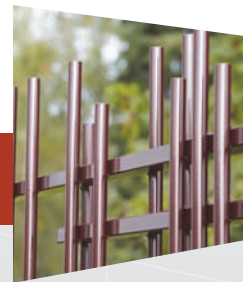
Surface mounted bars