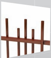
→ EXALT® ORIGIN