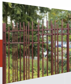
Additional cross rails