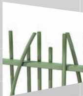
→ EXALT® NATURA