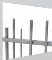
→ EXALT® DELTA