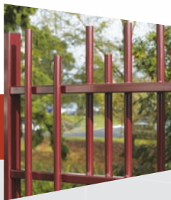
Bars with varied lengths